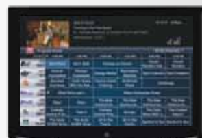
The Program Guide appears.