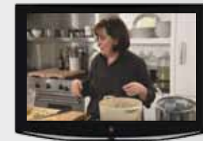
The menu screen is exited and a TV picture appears.

TIP: The Cancel button on your DISH remote is another option for exiting one on-screen menu at a time.