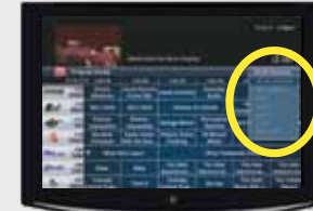
The Favorites List drop down menu appears.

b. Press and release the CHANNEL UP/DOWN buttons to choose the Favorites List you would like to see, then press and release the SELECT button.