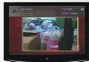
The TV channel changes.