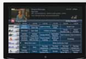
The Program Guide moves up or down.