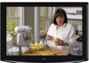
A TV picture appears.

If the picture is not restored, change your TV to channel 3 or 4 using your TV remote or the TV itself.