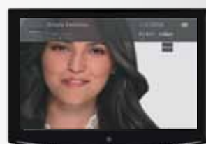
The TV changes to the highlighted channel.