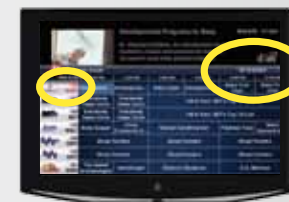
The Program Guide indicates which list you are on. If you are on the All Available list, channels shown in red are not included in your subscription.

b. Press and release the CHANNEL UP/DOWN buttons to choose the Favorites List you would like to see, then press and release the SELECT button.