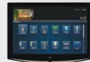
The TV is on a menu screen.