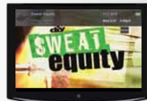
The TV channel changes.